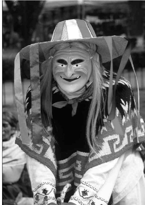
Colonial Mexico, Day of the Dead