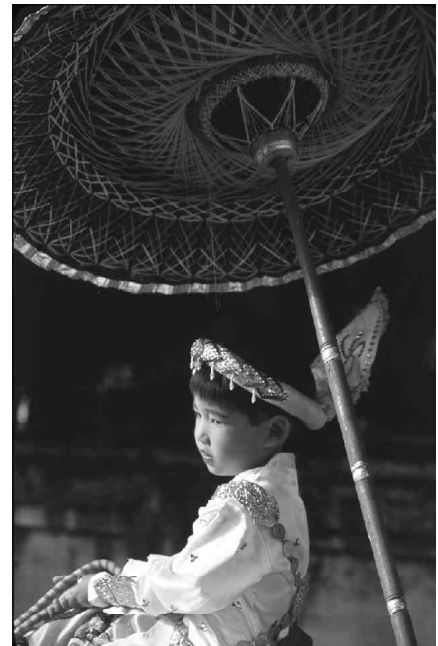
Faces of Burma