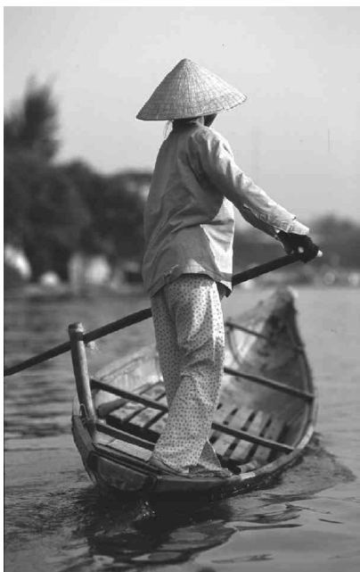
Mekong Delta, Faces of Viet Nam

Most Expeditions are limited to 7 photographers plus the guide, unless otherwise noted.