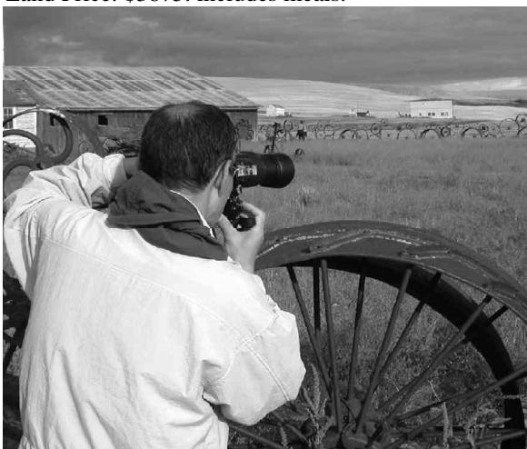
Palouse Country