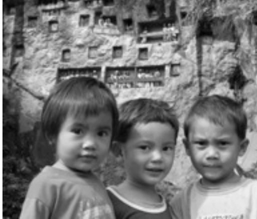
Toraja kids at Hanging Graves CUE Photo