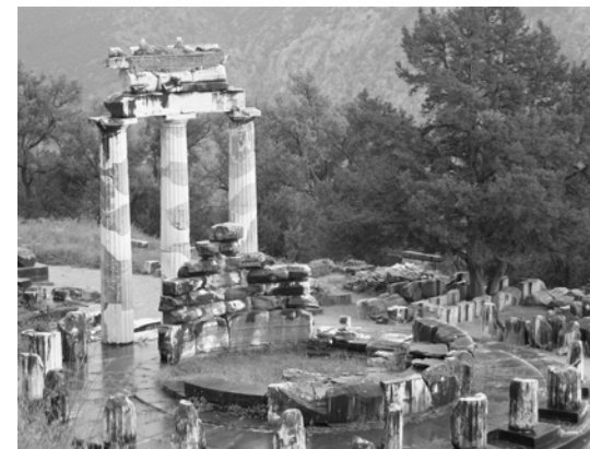
Temple of Athena