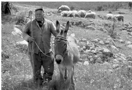
Shepherd of the Peloponnissos CUE Photo