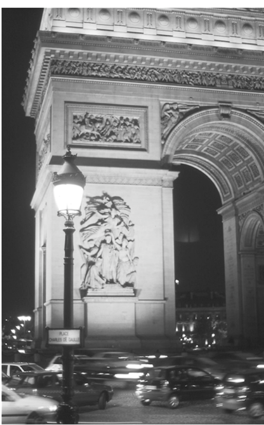
Arc de Triomphe at night