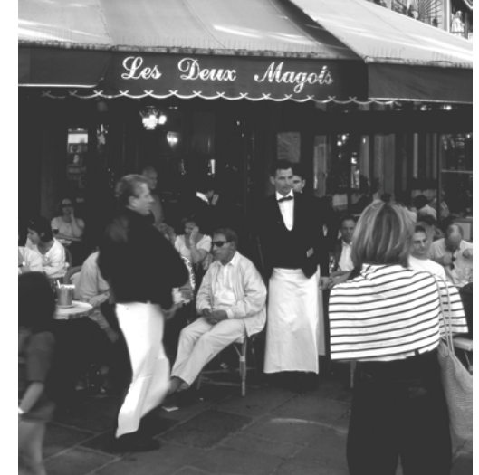
Cafe life along Boulevard Saint Germain

Paris owes its elegant look to Baron Haussman who, in 1848, under the rule of Napoleon III, razed the medieval city and created broad boulevards that criss-cross and meet in dazzling circles. It was decreed that buildings must not be more than four stories tall—thus the Mansard roof was employed to sneak in an extra floor creating garrets for starving artists. Broad-leaved Plane trees line the boulevards. Strolling any street is a history lesson with small plaques noting the house where