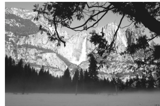
Yosemite Falls Winter

Days 4 & 5, Gold Rush Country: We leave the Park via Big Oak Flat—shooting all the way. Many minor scenes emerge in the waterfalls and streams that tumble down towards the Merced. Giant redwoods survive at Tuolumne Grove—great black & white subject in winter. Soon we are following the Tuolumne River Valley towards Chinese Camp and Highway 49 which courses north through the Sierra foothills connecting most all of the gold rush communities that sprung up virtually overnight after gold was discovered at Sutter's Mill in 1848. This was to be the gold rush of all gold rushes—the Mother Lode and early placer miners averaged $100 per day while $1 per day was the normal salary in San Francisco or Philadelphia. The history and traditions of these times are colorfully preserved at Columbia State Historic Park. The schoolhouse, bank, newspaper office, saloon and Wells Fargo office, and 30 other buildings, have been restored to reflect the life and times of the Gold Rush. You can try your luck panning for gold but the real nuggets are all around you in the weathered buildings, iron (and fireproof) shutters, and