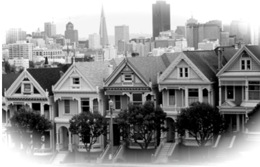
SF's Painted Ladies