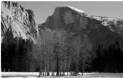
Half Dome in Winter